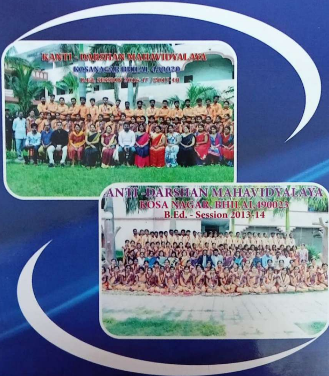
KANTI - DARSHAN MAHAVIDYALAYA KOSANAGAR BHILAI, 490020 B.Ed. SESSIONS 2016-17 / 2017-18

Vill. : Somani (Near Police Station, G.E. Road) Tah. & Distt. Rajnandgoan-491441 (C.G.) Phone No. : 9301328506, 6264599153